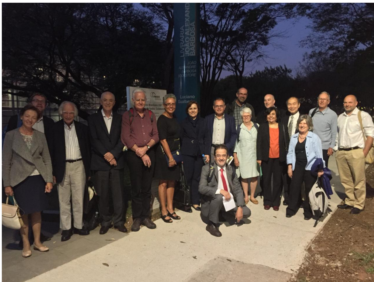
Participants in the Workshop